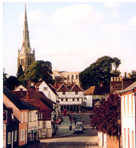
Thaxted. Warm and sunny maybe