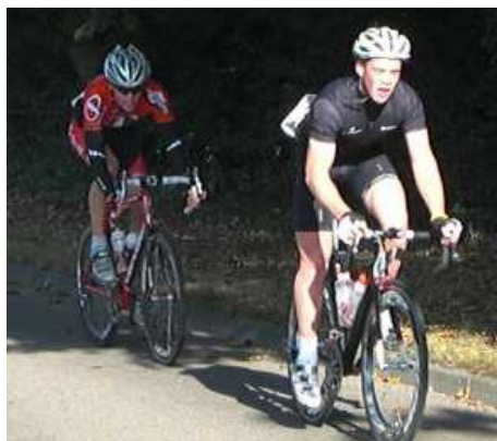
An early break heads out of Whitwell

The start-sheet showed a full field of 60 riders with 15 reserves. Yet there were 19 DNS, including 6 of the reserves, so all the remainder and a further 3 entries on the line meant we could start with 59 riders. The total distance was 108 km made up of 7.2 laps of a testing, 15 km three-cornered circuit of short hills and bends.