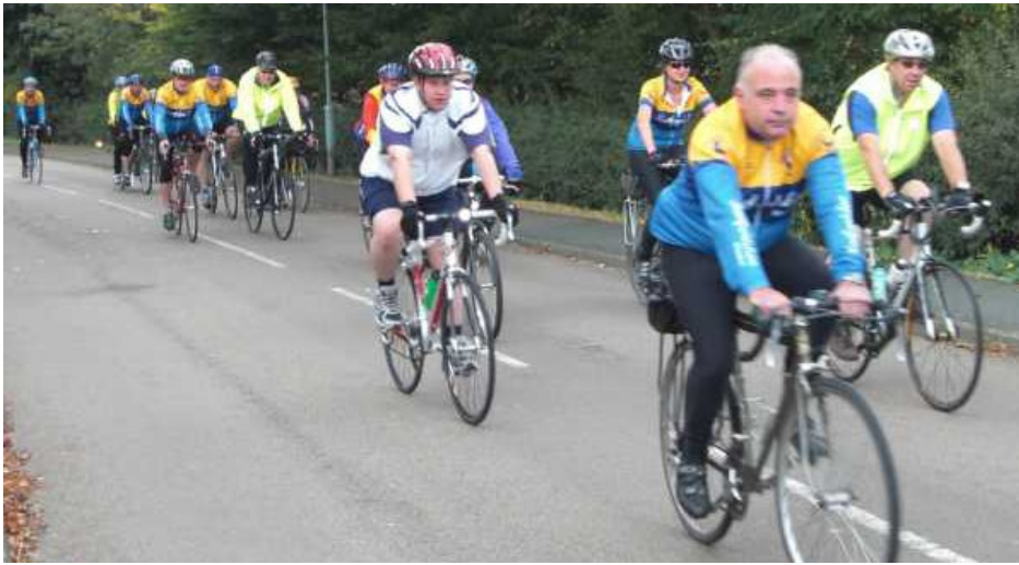
The Braughing peleton manages to keep to the left (mostly).