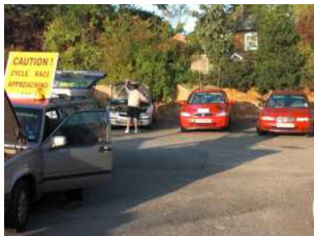
Race officials get ready at HQ

A slight frost meant that a cool start awaited the riders at the Event HQ - Fellowship hall in Whitwell. But there was no wind, and a cloudless sky soon provided a warm morning.