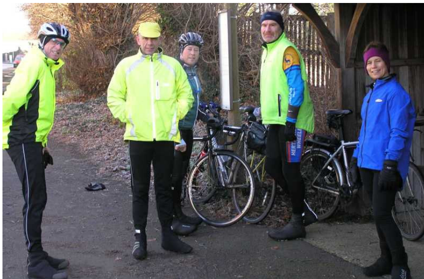
Dec 7 th , Much Hadham bus shelter. The group contemplates the forthcoming ride with varying degrees of enthusiasm.